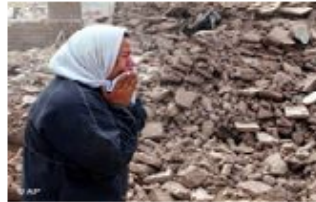
Grief after the fatal earthquake in Bam, Iran